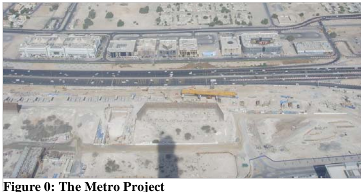
Figure 0: The Metro Project

BURJ DUBAI: IT'S OFFICIAL Iconic landmark is the tallest building on earth