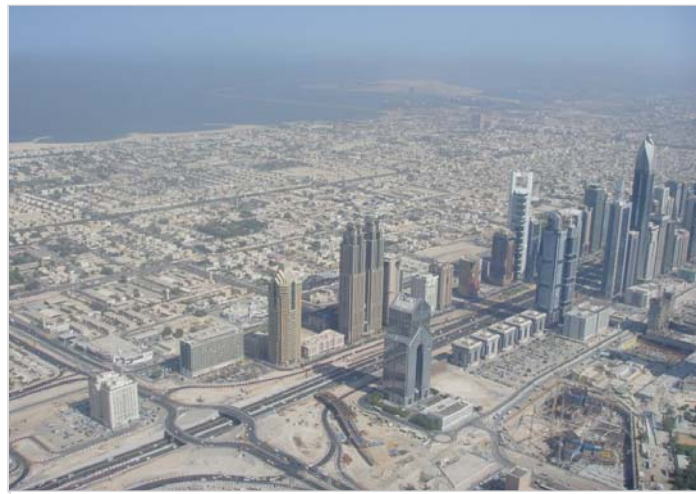
Figure 0: Used to be the Tallest Towers in Dubai

Figure 2 show another side of the main road (Sheikh Zayed Road) with all the towers that currently exist. These used to be the highest towers in the city and now they are almost miniscule in scale in comparison to the TOWER. What could be seen in this picture as well (top / right half of the picture) we can see the landfill in the sea that is ongoing for the third Palm of the Palms trio of projects. This would be the largest Palm and it would be huge; a truly iconic project interm of size and achievement.