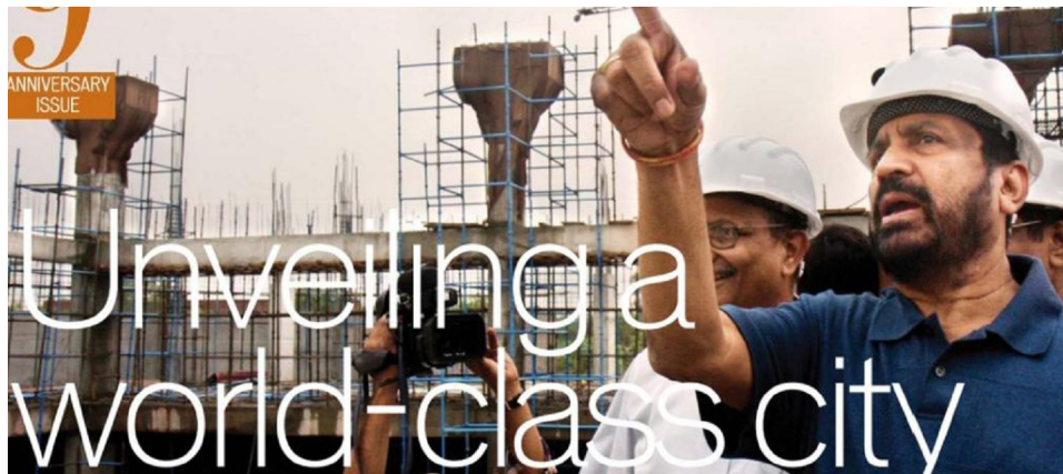
Suresh Kalmadi , Chairman 2010 Commonwealth ,Organizing Committee at a construction site , Delhi

Scheduled during October it is the most visible event that is expected to take place in 2010 in India. It has its share of controversy and debate mainly on whether it will be completed on time. In light of the 26/11 attacks at Mumbai and historical happenings in sports events in other parts of the world, terrorism and security is also a big issue. As project management professionals, it will be interesting to observe how the event will be managed! While at the operating level, professionals have or are being inducted, the top is managed by the ex-government officials and politicians. The scale of the project is huge as in case of any large scale sports event and one wonders if the right project management processes, tools and skills are being deployed. We have to keep our fingers crossed to see its outcome! However, some academic institutions (the Indian Institute of Management, Shillong and Drexel University, USA) have taken on a research project to study the games.