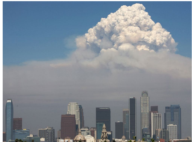
Photo: smoke from fire over downtown Los Angeles on 31 August 2009

Last month, a similar situation existed in Greece, as a huge fire threatened Athens and some of the world's most famous historic landmarks. Hurricane season is in full swing in the Atlantic, while a category 4 hurricane is today headed for Baja California on the Pacific coast of North America. Last year, thousand of hectares of land and hundreds of lives were destroyed by fires near Melbourne, Australia. Massive floods resulting from a Monsoon devastated a major section of Taiwan this year, and are expected again throughout Southeast Asia.