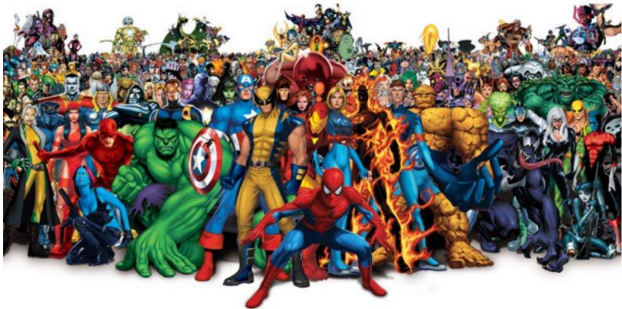
Marvel Entertainment characters – now owned by Disney

Yesterday, the Walt Disney corporation announced that it will acquire Marvel Entertainment, Inc. for about US$4 billion in cash and stock. Disney will gain Marvel's animated "empire", including over 5,000 such characters as Iron Man, X-Men, Spider-Man, Fantastic Four, Thor and Captain America, among others. While from the outside, this just seems like more entertainment, it is a major deal within the entertainment field. This is especially true for those working on software, games, videos, movies and other products and services utilizing any of the thousands of Marvel or Disney characters – a "game changer" in that business.