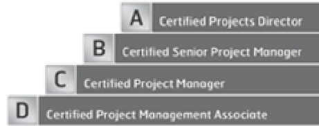
IPMA Certification Model

Our analysis examined live and projected certificates on the registers of the PMI and the IPMA for 2008.